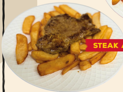
STEAK AND FRIES $11.50

Thinly sliced steak, and thick cut fries.