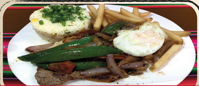
LOMO MONTADO $19.50

Steak, stir-fried onions, jalapeño peppers, and tomatoes. Served with rice and fries. + TOPPED W/FRIED EGG (SUNNY SIDE UP OR FULLY COOKED)