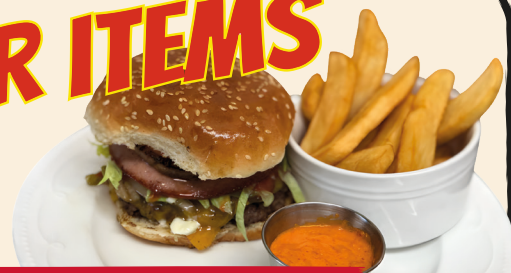
COPACABANA CHEESEBURGER $13.99

Consists of a 6 oz beef patty, sliced hot dog, a slice of ham and 1 piece of bacon. Completed with shredded lettuce, tomato, pickled jalapeño, grilled pineapple and grilled white onion.