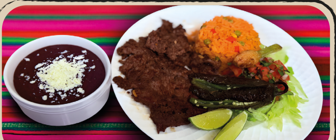
MEXICAN CARNE ASADA $18.00

Steak, stir-fried onions, jalapeño peppers, and tomatoes. Served with rice and fries. + TOPPED W/FRIED EGG (SUNNY SIDE UP OR FULLY COOKED)