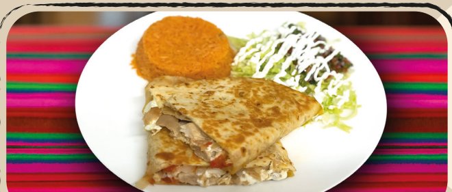
COPACABANA CHICKEN QUESADILLA $17.00

Steak Platter. Served with mexican rice, refried beans, and yellow tortillas. With a side of salad (Shredded lettuce, pico de gallo, jalapeño and baby onion)